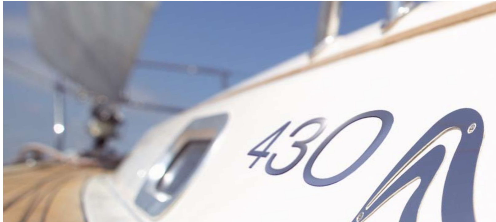
Design Judel / Vrolijk & Co.